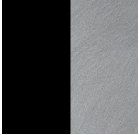
Black/Satin Aluminum - BSA